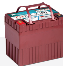
TR 25.6-25 LI-ION

Microprocessor Cell Balancing SOC Gauge Battery Management System