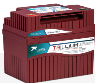
TR 12.8-92 LI-ION

Trillium gives you more runtime and longer life than other batteries in its class and delivers consistent power across the state of charge range. It's 20% smaller than competitors' batteries, can be charged in less than two hours, and is scalable up to 48 volts.