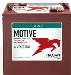
MOTIVE 6-VOLT AGM