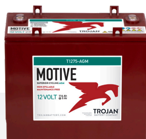
MOTIVE 12-VOLT AGM