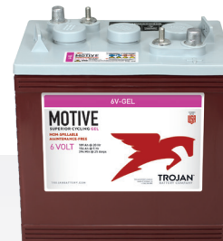
MOTIVE 6-VOLT GEL