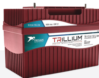
TR 12.8-110 LI-ION

Microprocessor Cell Balancing CAN Communications Battery Management System SOC Gauge