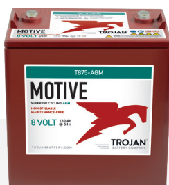
MOTIVE 8-VOLT AGM

C-Max Technology Proprietary Paste Premium Separator