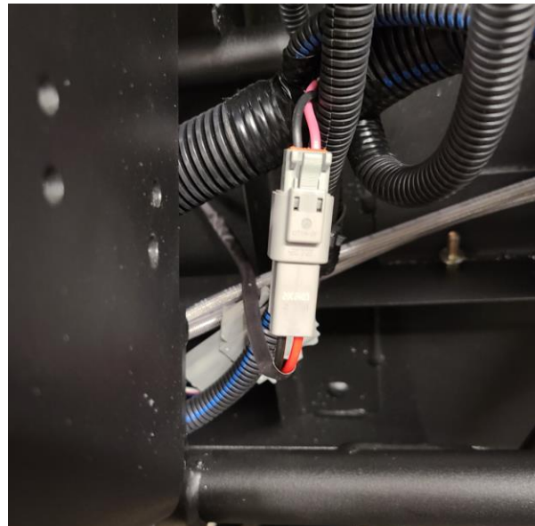
Figure 11: USB Power Connector hooked up