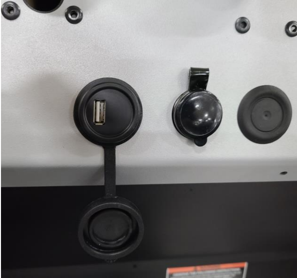
Figure 9: Setting orientation of the weather cap