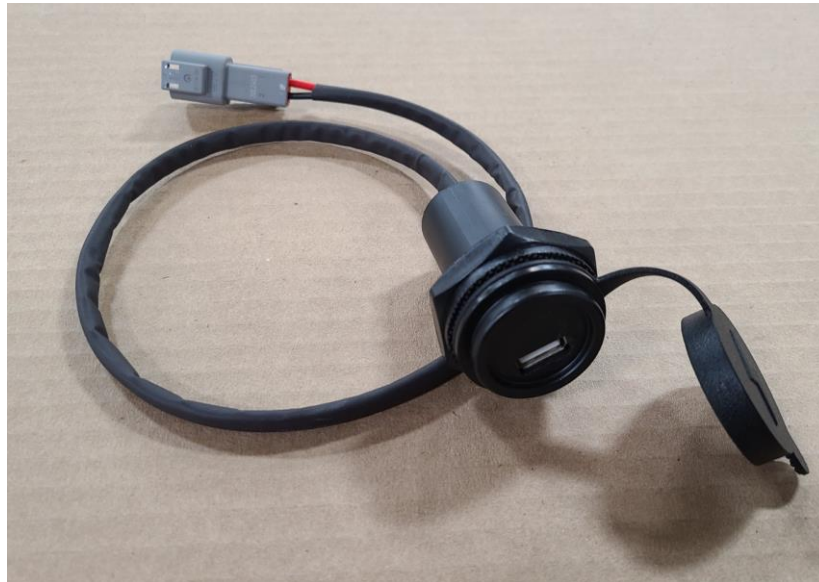
Fig 1 – Kit contents – USB Charger