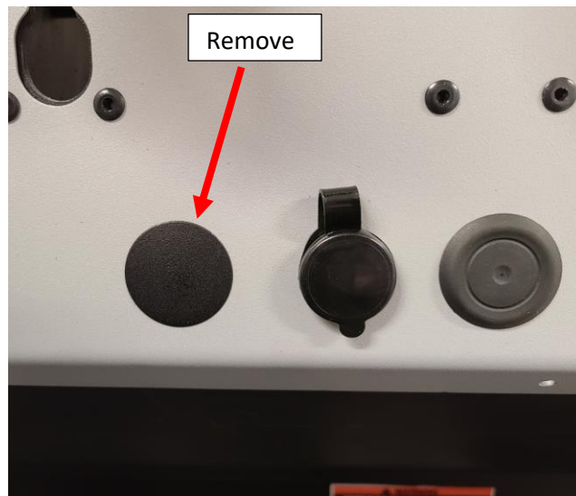
Figure 6: Remove the USB Plug