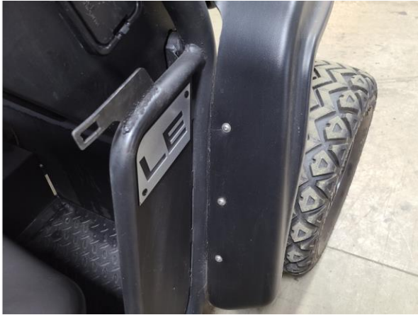
Figure 2: Removing Three Fender Fasteners