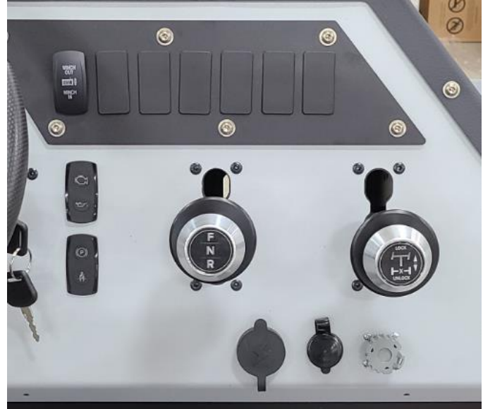
Figure 10: USB cap sealed