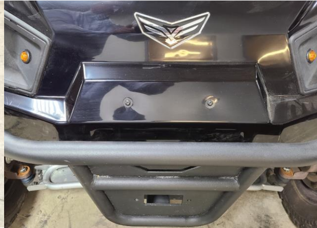
Figure 3: Removing Two Hood Fasteners