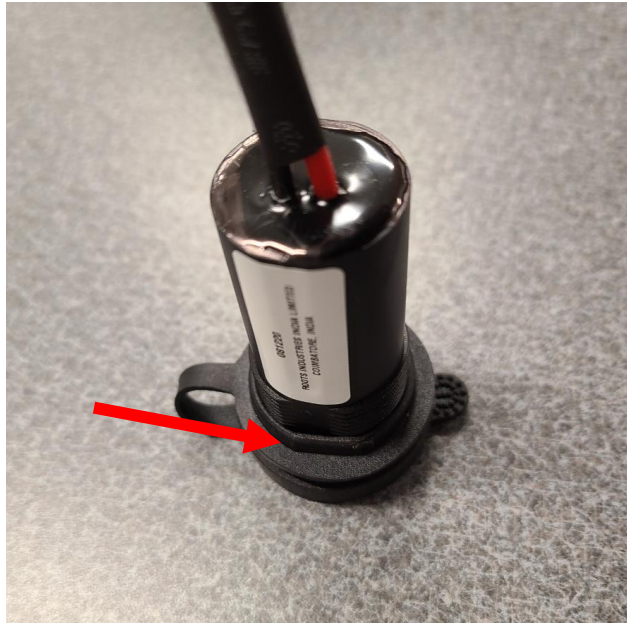
Figure 7: Identifying the USB Keying feature